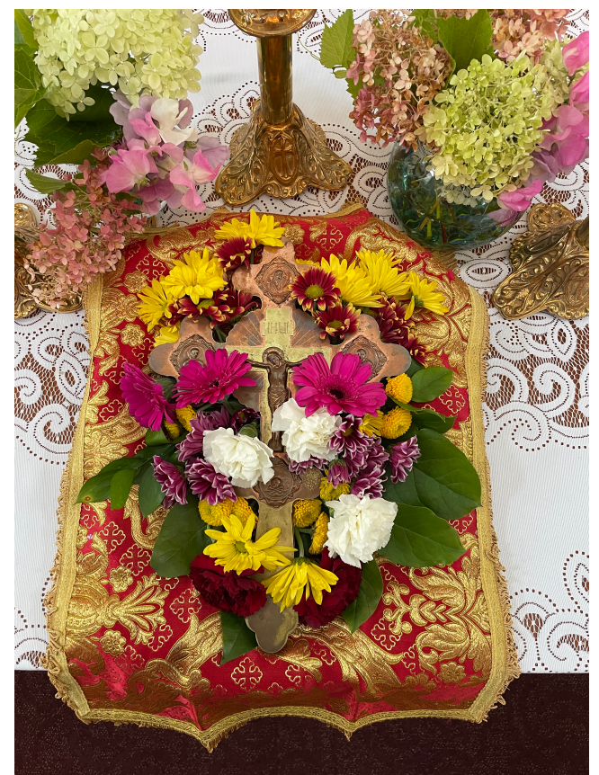
The adorned Cross from the celebration of the Feast of the Exaltation of the Cross served in All Saints, St. Paul on September 27<sup>th.</sup>

I am looking forward to the year ahead and the return of many of our activities that bring life to our parishes. All of these activities would not be as successful without the help and support of all those listed above and all of you! Sincerely, thank you!